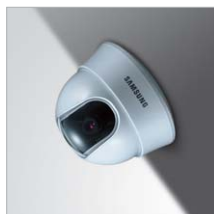
Wall Ceiling Inclined Surface